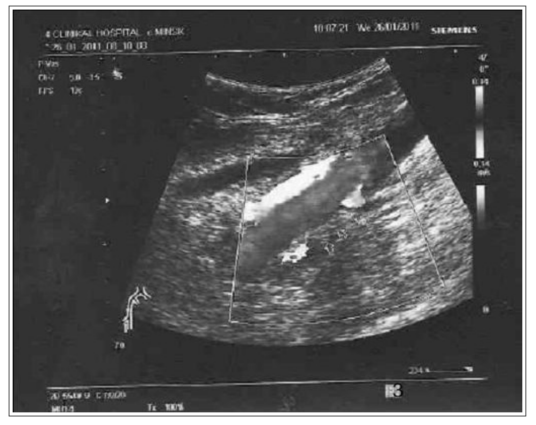
Figure 3. Femoral artery ultrasonography (the arrows indicate deep femoral artery with the graft)

artery at the site of capsule implantation without significant hemodynamic disturbances (Figure 3).