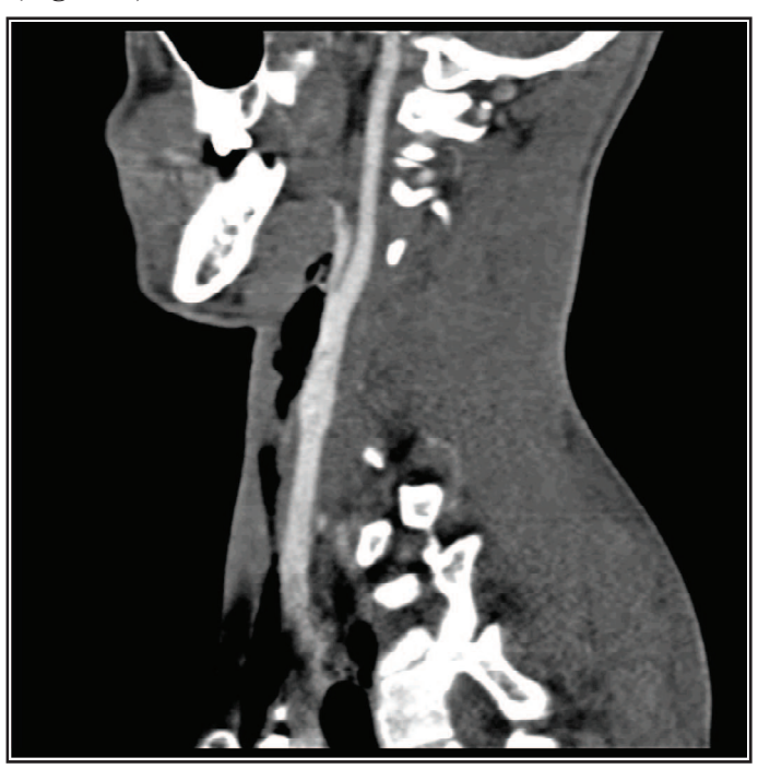
Figure 3. Stenosis of the right CCA noted during the angioCT of the neck

AngioCT of the neck and head confirmed the rupture of the intima in the right CCA associated with significant stenosis (Figure 3).